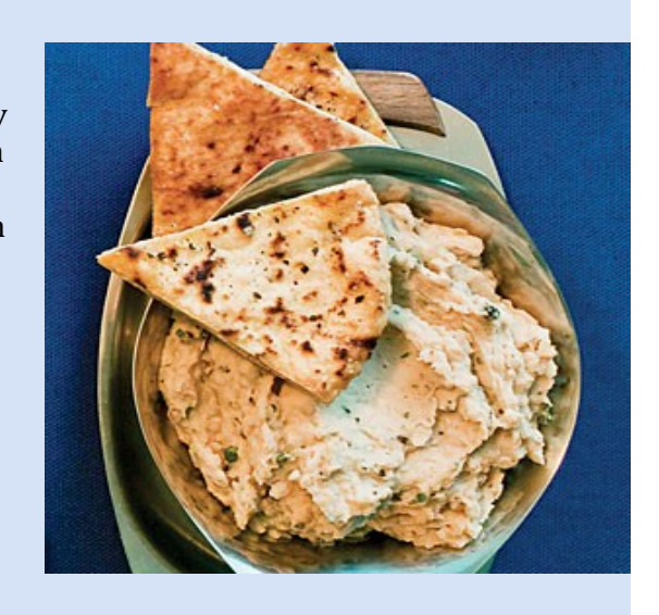
Recipe from www.myrecipes.com