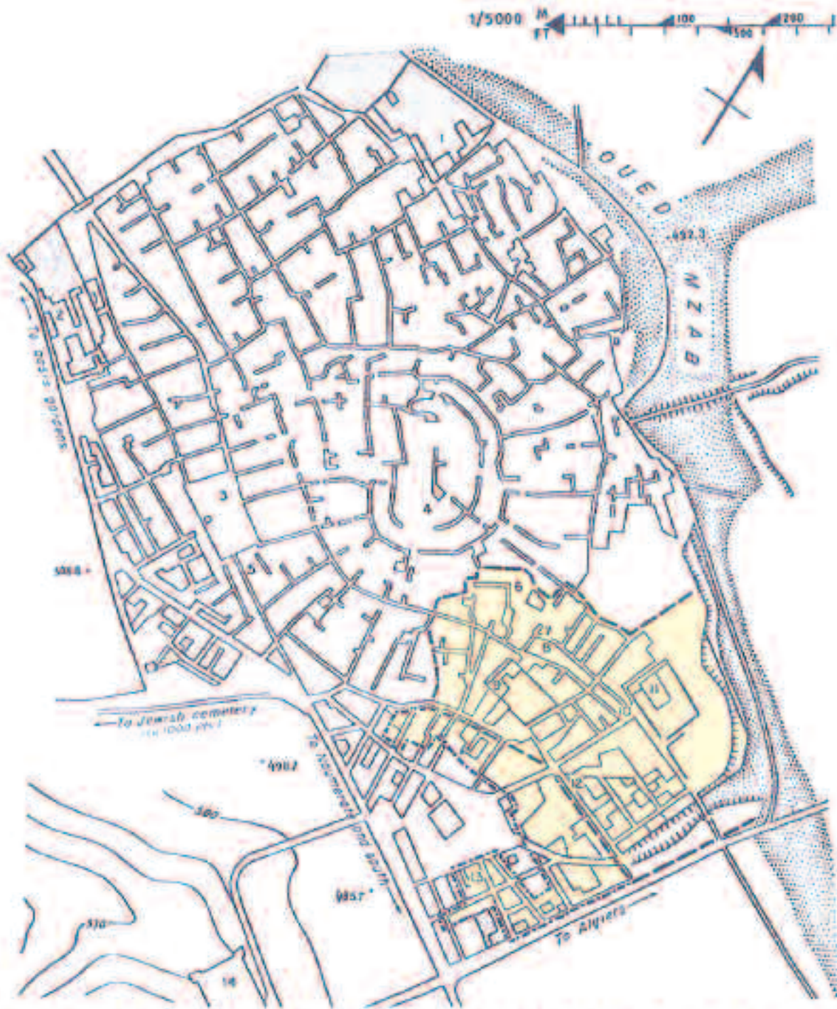
FIG. 2. Simplified plan of the city of Ghardai. Approximate limits of the Jewish quarter: old (mainly residential), - - -; new (mainly commercial), - · - · -. Shaded areas represent enclosures, such as gardens, freight yards, etc. Many streets appear to be interrupted where they pass through archways or tunnels beneath houses.