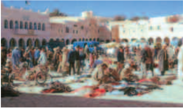
FIGURE 2 | The Zuk (Central Market).

Jerusalem cinq," (Jerusalem Street, number five) and pointing the way. My heart was beating much too fast. I then asked, "Y-a-t'ails des juifs ici?" (Are Jews living here?). He answered, "a couple," I ran up the street and turned on Jerusalem Street, and about half a block down on the right was a semi-destroyed building with a Mogen David, a six pointed star made of Iron on the top of an old wooden door (Figure 1).