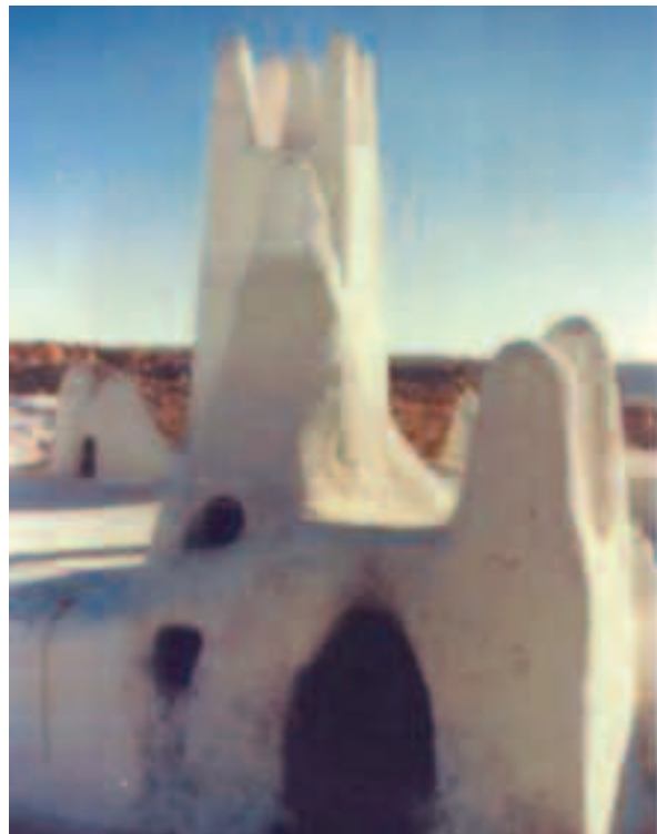
FIGURE 3 | M'Zab Architecture (tomb).

The next stop was a minaret that was striking with its gleaming white-wash exterior, lack of sharp edges, round comers, and a few odd-placed, little, square windows, used for protection from the intense sunlight. The projection a pencil of light into the interior dramatically enhanced the experience. These features reminded us of Le Courbousier, the famous Swiss-French architect and, particularly, his rendition of the Cathedral of Notre Dame du Haut (also called Ronchamp). I was rapidly informed by locals that Le Courbousier had, indeed, visited Ghardaia but to my knowledge, never publicly recognized the influence. The same architectural details are exhibited in the tombs of the local cemetery (Figure 3).