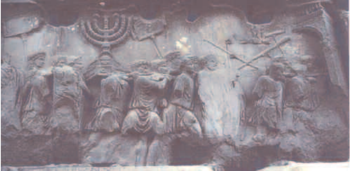
FIGURE 5 | The Arch of Titus. Depiction of the triumphal march of the Roman soldiers through the “Foro Romano,” returning from Jerusalem and carrying their booty: the sacred Menorah (center image), the Table of the Shewbread shown at an angle (not apparent in this photo), and the silver trumpets (extreme left and upper third), which called the Jews to Rosh Hashanah. The bearers of the booty wear laurel crowns and those carrying the candlestick have pillows on their shoulders.

(Destruction of the First Temple), and exiled the Jewish people, some of which went to Sepharad, while others went to Babylonia. Still, others established Jewish communities all around the Mediterranean, including Egypt where they constructed a Temple in Elephantine, and on the North African coast, especially in Carthage, and on the island of Djerba. Others contend that Jews arrived to Sepharad around 70 CE, when Roman legions under Titus conquered the city and destroyed the Temple (Destruction of the Second Temple) and forced the Jews into a second diaspora (Figure 5). The Sephardic sources in Spain are equally divided: the Jews of Granada contend that after the destruction of the First Temple, they came to Al-Andalus (present day Andalucia) where they founded Granada and later extended to Cordova and Toledo. The name of Toledo could have come from either of the Hebrew words “toledot” or “titull.” The Jews of Merida claim that the move to Al-Andalus was after the destruction of the Second Temple. For the history of Spain, this is an important dilemma. For the history of the Jews in M’Zab, all of this mattered less since their migration to the Sahara occurred after the destruction of the second Temple. The Sephardic physical aspect could be derived, not from the migration of Sephardic Jews from Sepharad (Spain) but from the same stock that populated Sepharad.